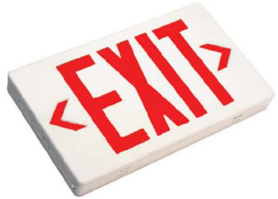
GXU2RWEM Universal Mount LED Exit

Available in Black or White Finish, Red or Green Letters